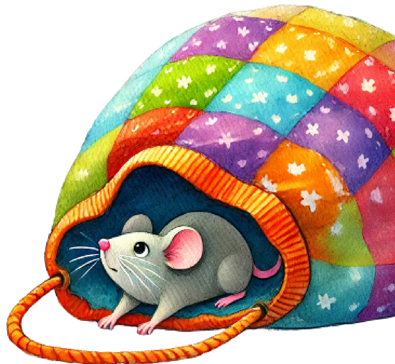
A rat in a bag