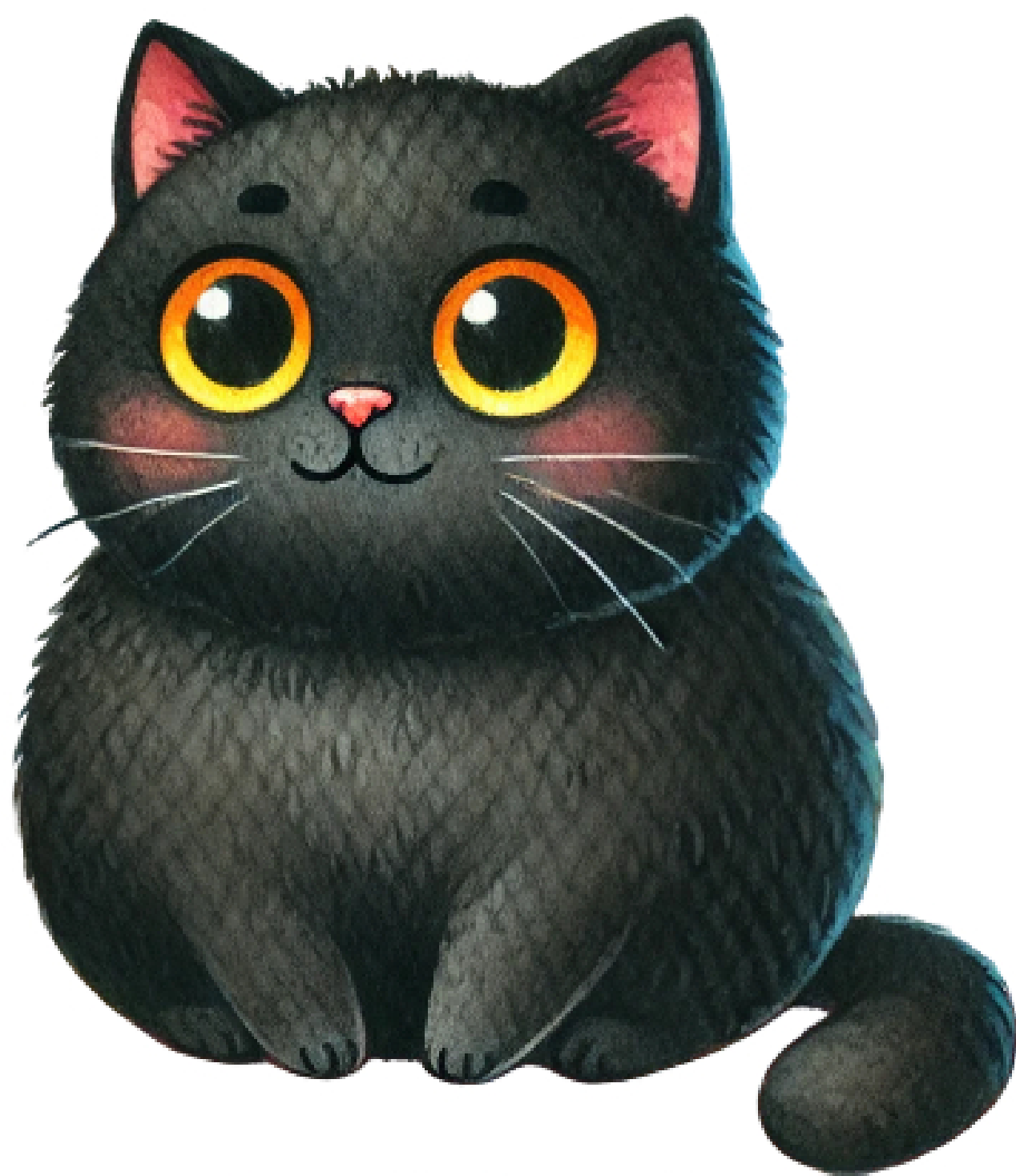
Max the black cat