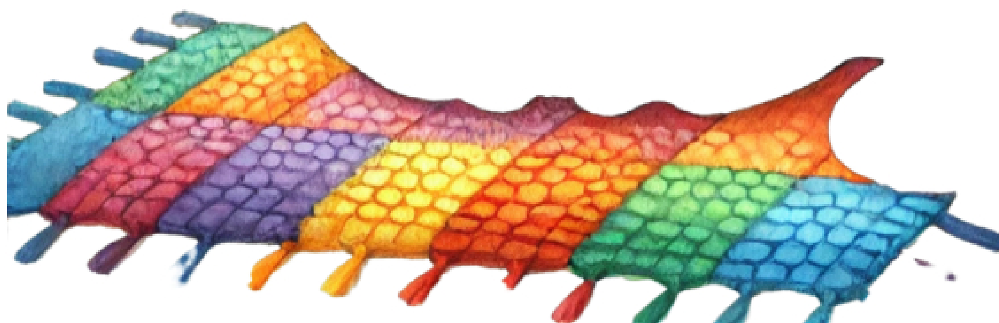
A colorful mat